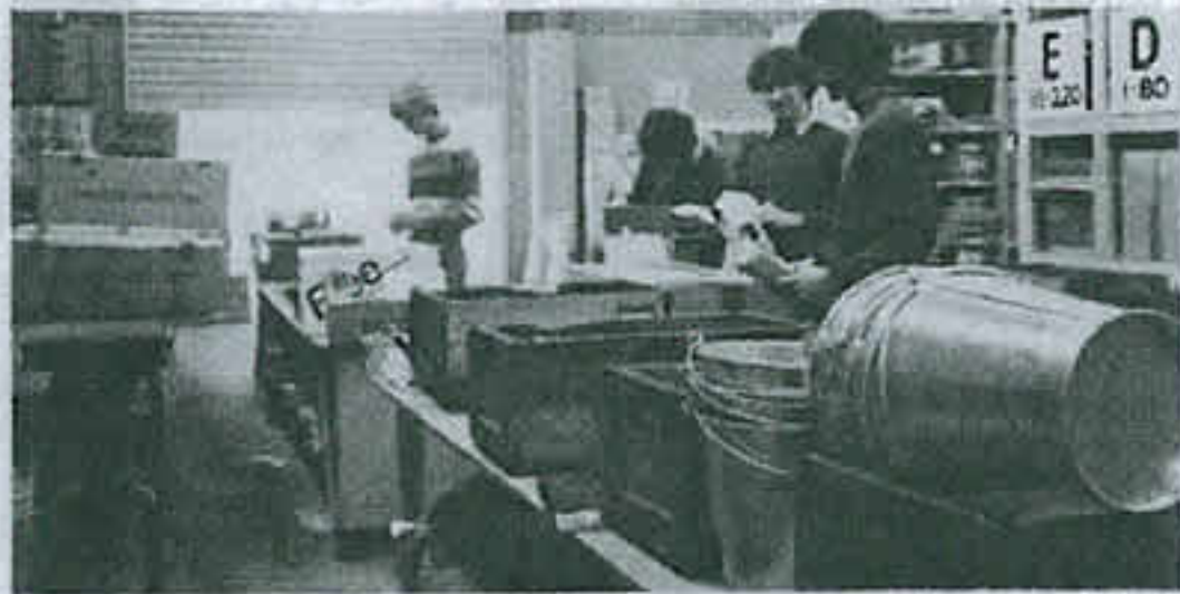
Above: The warehouse staff.

During the growth period of 14 years, staff at R.D.S. has