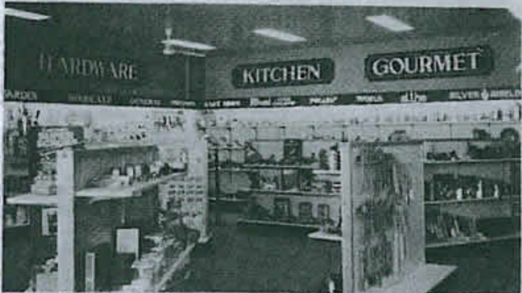
Above: Some of the products to be seen in the attractive R.D.S. showroom.