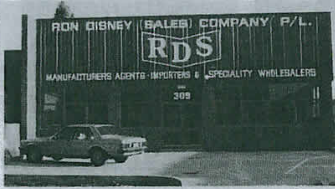
The new premises where a welcome awaits customers.