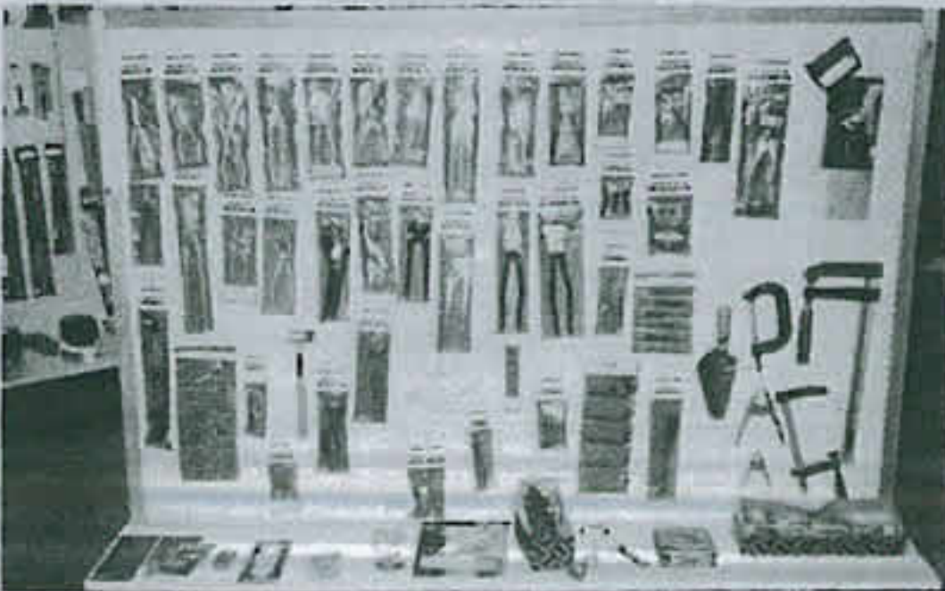
Below: The very latest products available from R.D.S. are those included in the 'Boker' range.